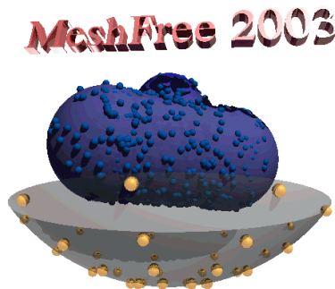
Figure 1: We center the caption.